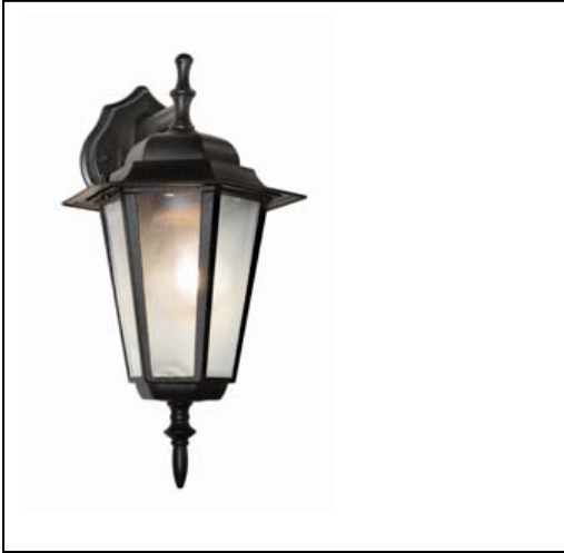
4055 BK: 1 Light Coach Lantern