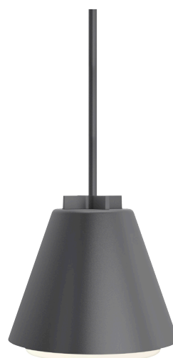
BOWMAN 12 PENDANT shown in charcoal

* Visit techlighting.com for specific warranty limitations and details.