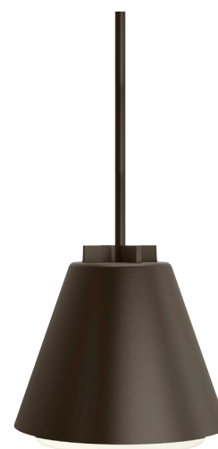
BOWMAN 12 PENDANT shown in bronze