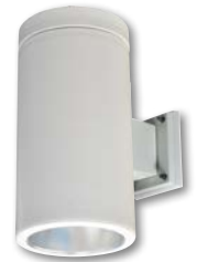
NYLI-6W Wall Mounted