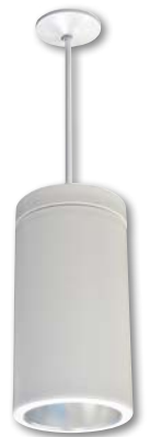
NYLI-6P Pendant Mounted