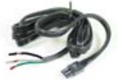
72" Cord & Plug

NUA-804B Black NUA-804W White Used to hardwire NUD-88 fixtures to NUA-802 or junction box (by others). Finish: Black or White