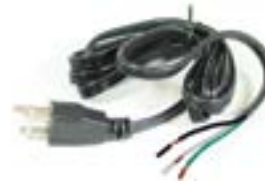
72" 3-Wire Grounded Hardwire Connector

NUA-803 Used to join two NUD-88 fixtures seamlessly together. 3-wire grounded connector. Finish: White