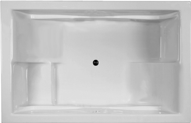
Features textured bottom.