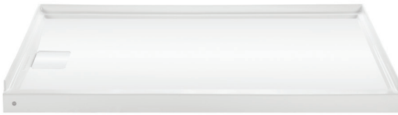
Color matched SculptureStone® hidden drain cover comes standard on white base.