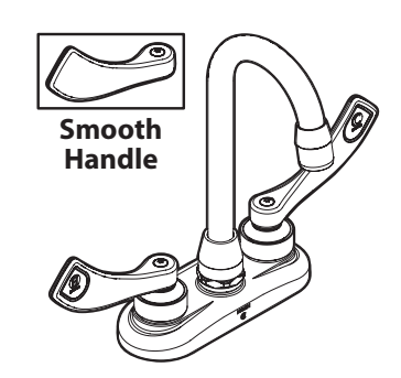
M-Dura™ Two-Handle Bar/Pantry Faucet