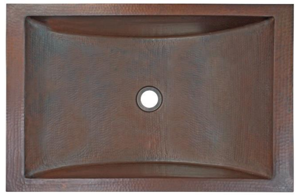
Shown in DB