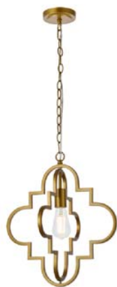
Brass Item No:LD7063D16BR